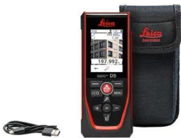
Leica DISTO™ D5 Art. No. 950908

Leica DISTO™ D5, Pouch, USB-C to USB-A Cable, Hand Loop, Quick Start Guide, Warranty card, Safety Manual, Calibration Certificate Silver