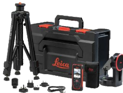
Leica DISTO™ D5 Package Art. No. 950879

Leica DISTO™ D5, Pouch, USB-C to USB-A Cable, Hand Loop, Quick Start Guide, Warranty card, Safety Manual, Calibration Certificate Silver