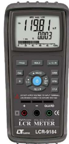
HOLSTER Model : HS-03