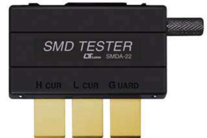
SMD TESTER, optional Model : SMDC-22