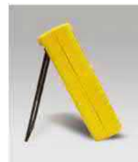
Clamp Probes, A1, A2, A3 CP-1201