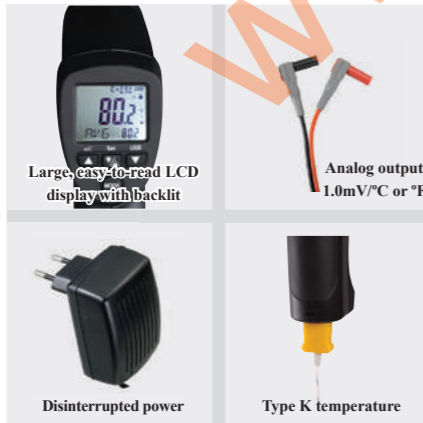
Large, easy-to-read LCD display with backlit