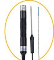
Temperature probe (Optional: NR-31B / TP-500 / TCP-100)