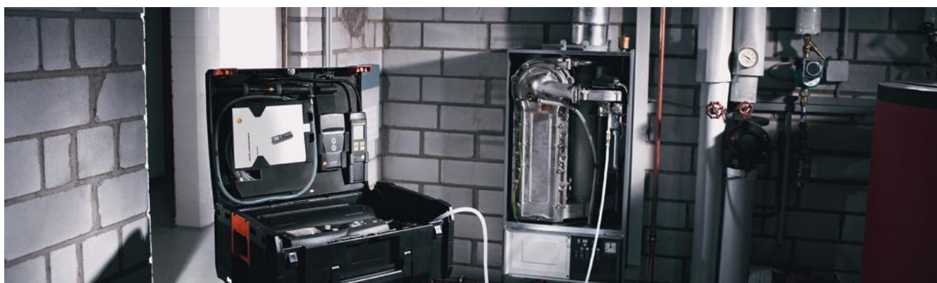
Automatic servicability test with gas-feed appliance with connection to the gas boiler