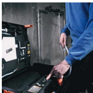
Automatic tightness test