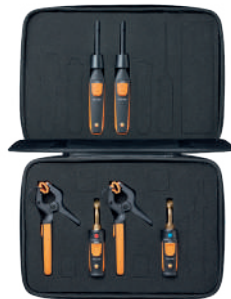
AC/R Test & Load Kit: 0563 0009