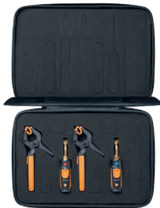
AC & Refrigeration Kit: 0563 0002 20