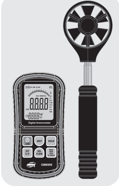
Version: GM8909-EN-00 7168909002 A1

تأمین تجهیزات و مواد مصرفی تست های غیر مخرب ایران ۰۲۱-۲۱۰۵۳۸۸۸ ۰۹۱۲۰۲۶۶۲۷