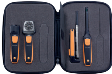
VAC Smart Probe Kit: 0563 0003