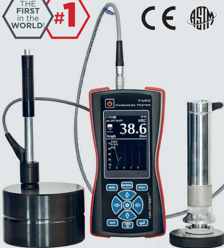
Leeb Probe ASTM A956