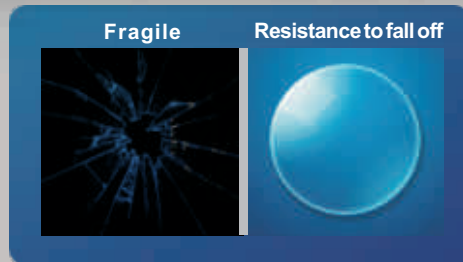
Special Optically PMMA Lens