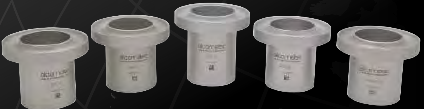
Viscosity - Flow Cups