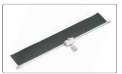
Right angled rubber probe