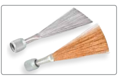
Band brush probes