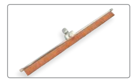
Right angled wire brush probe