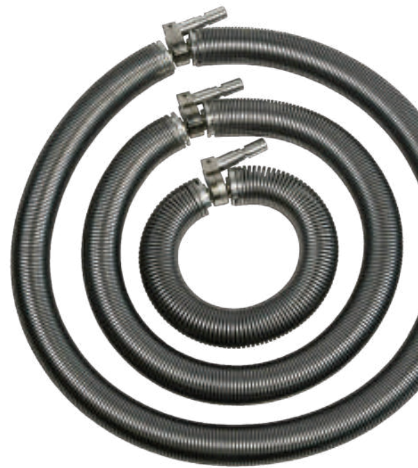
Rolling Spring Electrodes