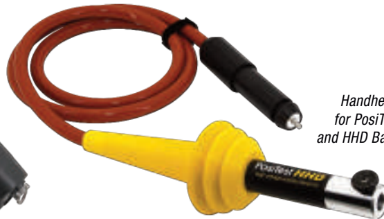
Handheld Wand for PosiTest HHD and HHD Basic only