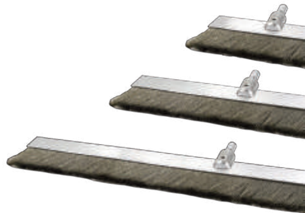
Flat Wire Brush Electrodes

Use spring and brush electrodes made by other manufacturers with DeFelsko adaptors: