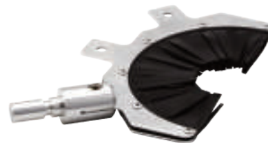
Half Circle Neoprene Brush Electrode