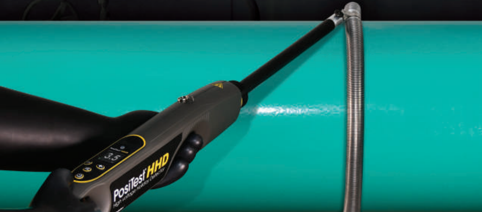
PosiTest HHD shown with optional spring electrode

Available in Stick-Type or Wand-Style models