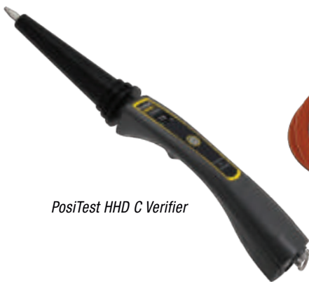
PosiTest HHD C Verifier