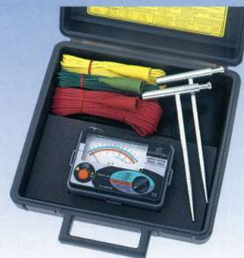
MODEL 4102A-H (Hard Case Model)