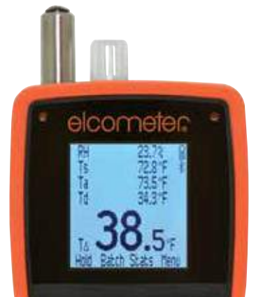
View up to 5 user selectable statistics on screen