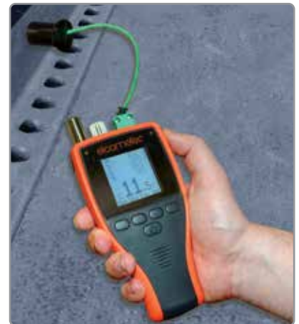
Easy to use with an intuitive menu structure

Connect the Elcometer 319 via Bluetooth® or USB to a PC, Android™ or iOS mobile device & download the data into an inspection application or into ElcoMaster® for instant report generation.