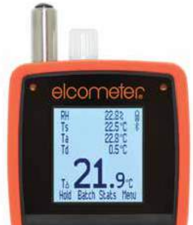
Large easy to read measurements in degrees °C or °F

BS 7079-B4, IMO MSC.215(82), IMO MSC.244(83), ISO 8502-4, US Navy NSI 009-32, US Navy PPI 63101-000