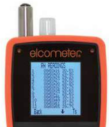
Review individual readings

The Elcometer 319 can be used as either a hand-held dewpoint meter or as a remote data logging monitor. 2