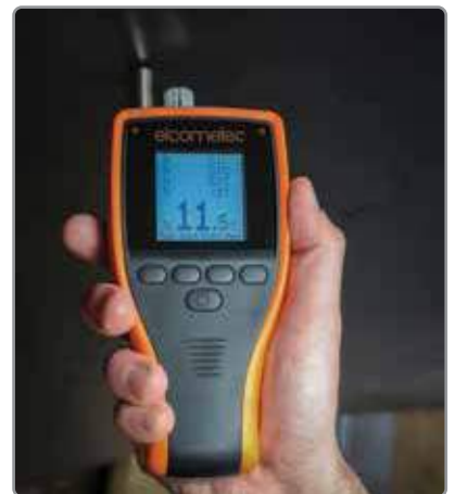
Dustproof and waterproof with fully sealed sensors