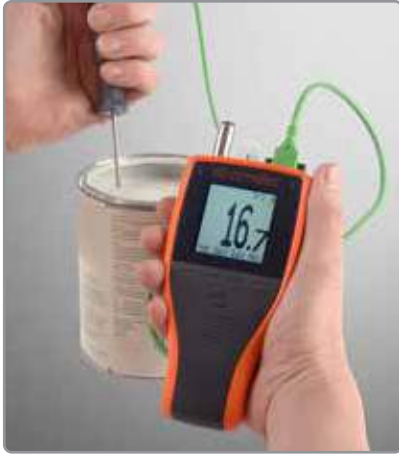
Te - Ideal for use as a simple thermometer