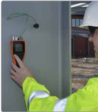
Waterproof and rugged to IP66